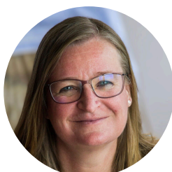
Astrid Podzialowski EU Agency for Fundamental Rights