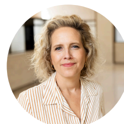
Caroline Vrijens Flemish Commissioner for Children's Rights