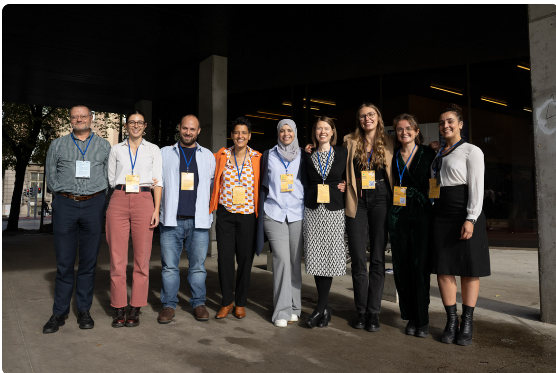
The CFJ-EN operational team